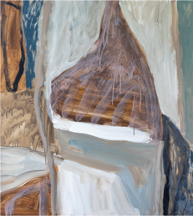
Hinterland Trek 2023 acrylic on canvas 105 x 95 cm