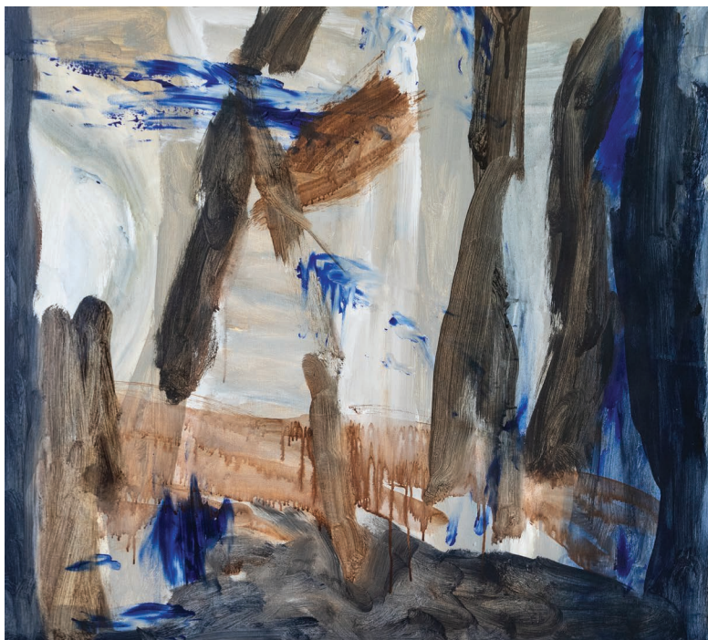
After the Flood 2023 acrylic on canvas 95 x 105 cm