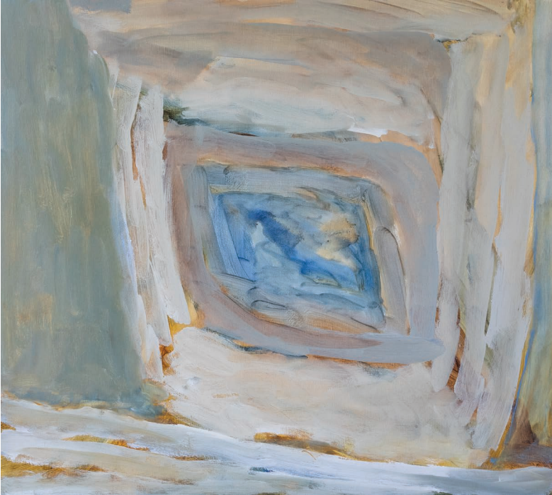
Place From a Dream 2023 acrylic on canvas 95 x 105 cm