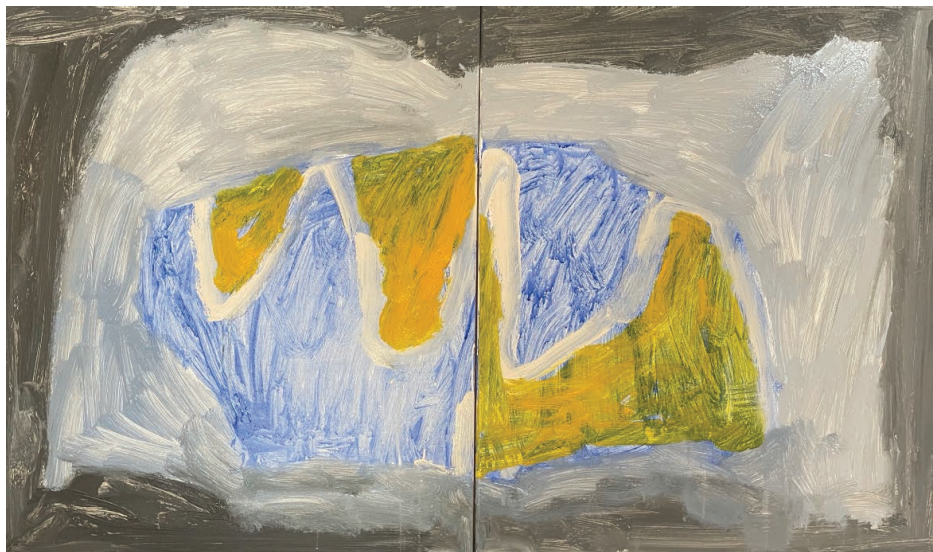
Untitled 2021 acrylic on canvas 65 x 105 cm, diptych.