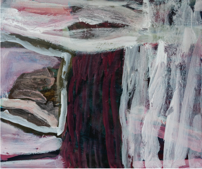
Dirt Play 2023 acrylic on canvas 53 x 53 cm