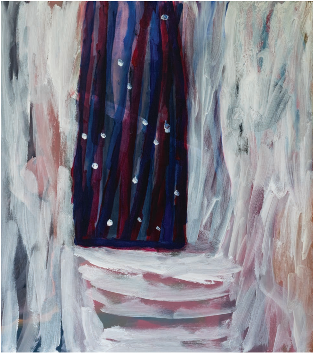
Hideaway 2023 acrylic on canvas 105 x 95 cm