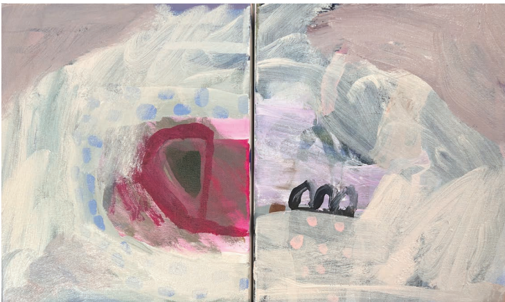
Emerging 2023 acrylic on canvas 33 x 53 cm, diptych.