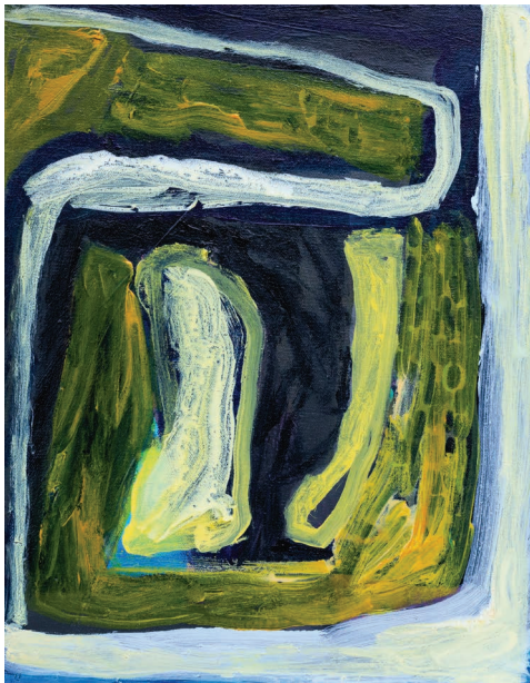
Yellow Paddock 2023 acrylic on canvas 48 x 38 cm