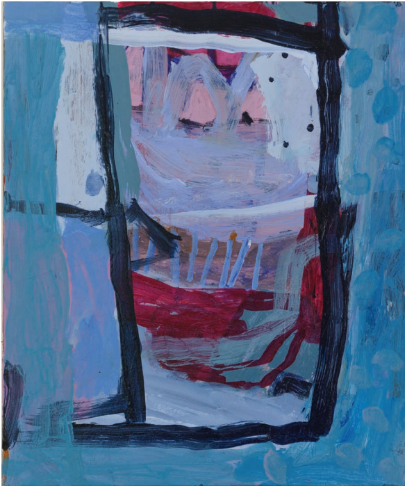
Looking Out 2023 acrylic on canvas 63 x 53 cm