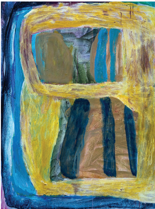
Scar 2023 acrylic on canvas 103 x 83 cm