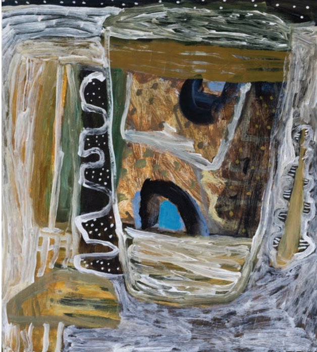
In My Bones 2023 acrylic on canvas 105 x 95 cm